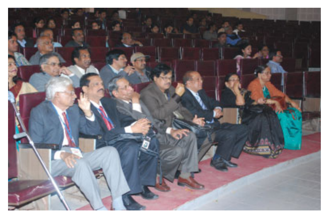
Part view of delegates attending Annual General Body Meeting (AGM-2012)