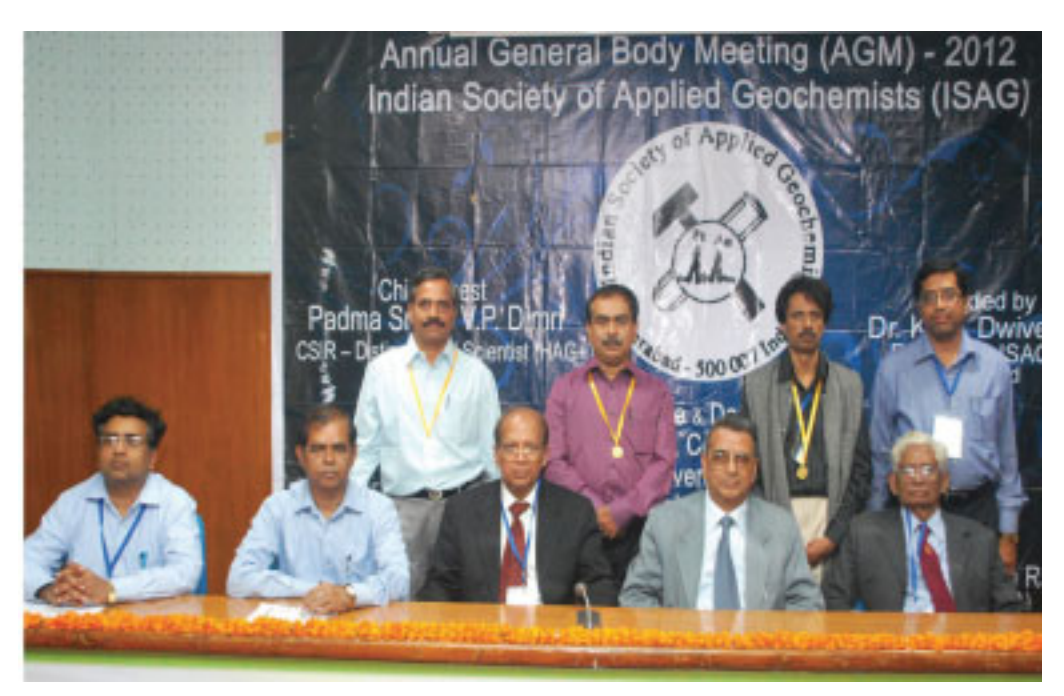
ISAG Medal winners with Executive Council and Organising Committee members.