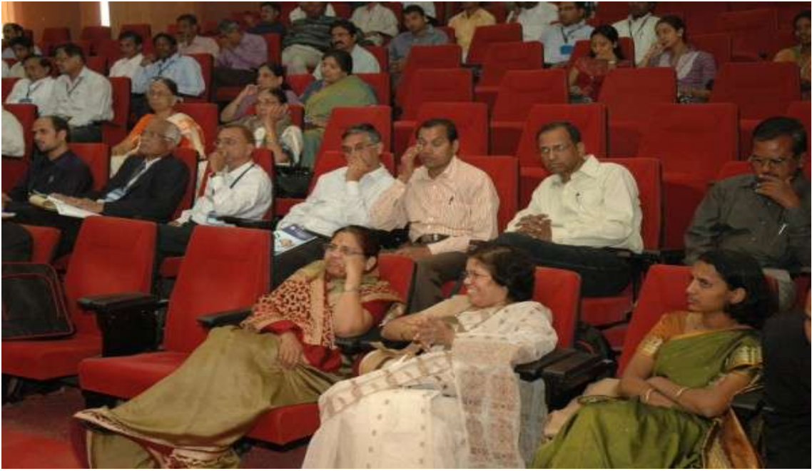
A view of the delegates – View 1.