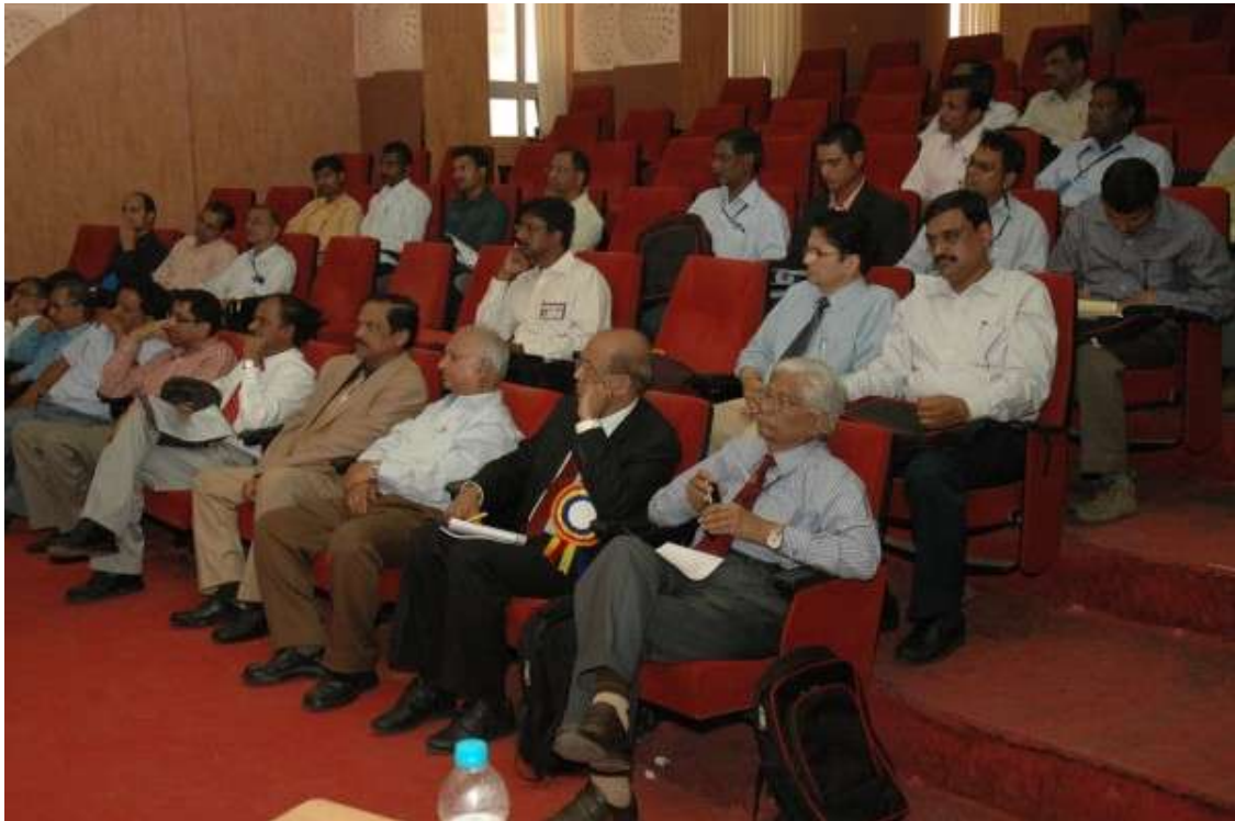
A view of the delegates – View 2.