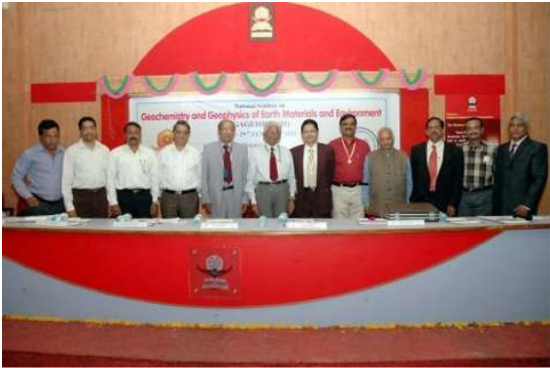
Organising Committee members with Medal Awardees after the conclusion of the AGM-2011 and valedictory function of National Symposium-2011.