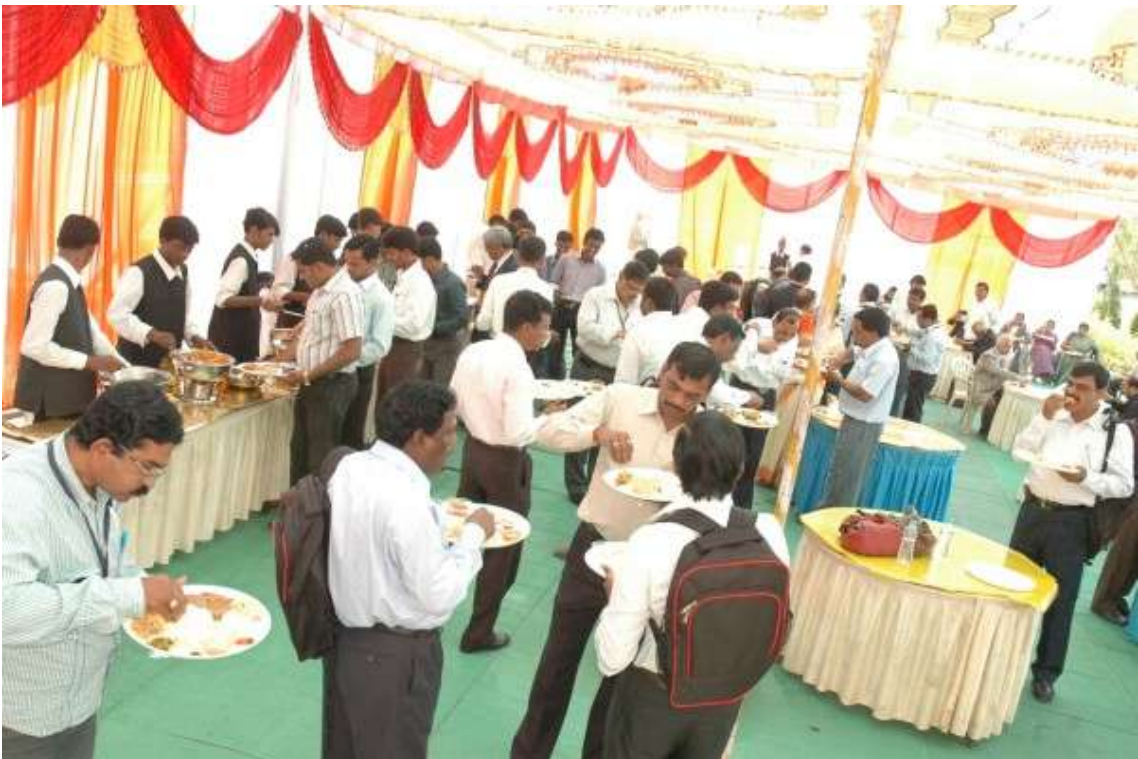
Delegates enjoying lunch.